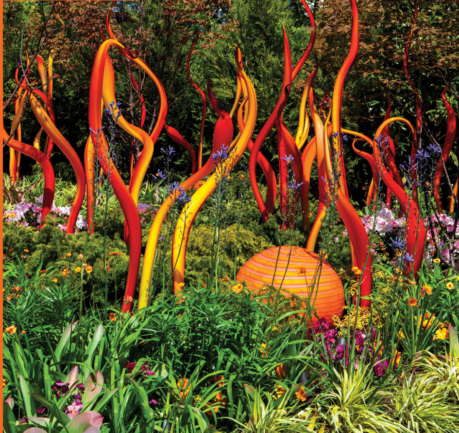
All artwork and photos © Chihuly Studio. All rights reserved.

"I want my work to appear like it came from nature, so that if someone found it... they might think it belonged there." - Dale Chihuly